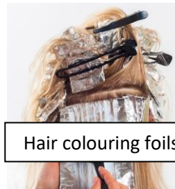
Hair colouring foils