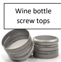
Wine bottle screw tops