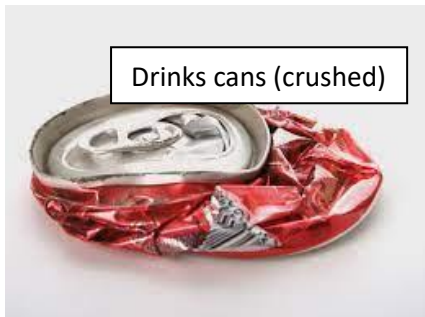
Drinks cans (crushed)