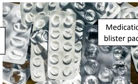
Medication blister packs