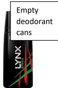
Empty deodorant cans