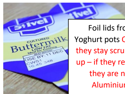
Foil lids from Yoghurt pots ONLY if they stay scrunched up – if they re-open they are not Aluminium