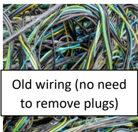
Old wiring (no need to remove plugs)