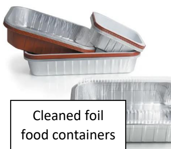
Cleaned foil food containers