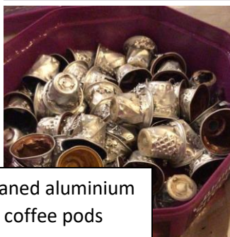
Cleaned aluminium coffee pods