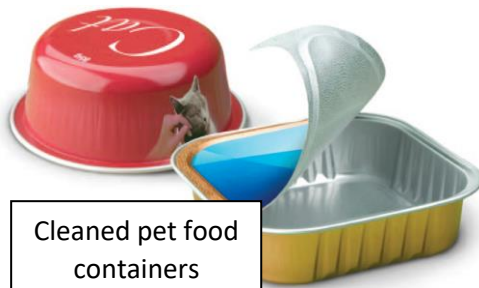
Cleaned pet food containers