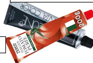
Tomato paste tubes / Hair colour tubes ( REMOVE CAPS )